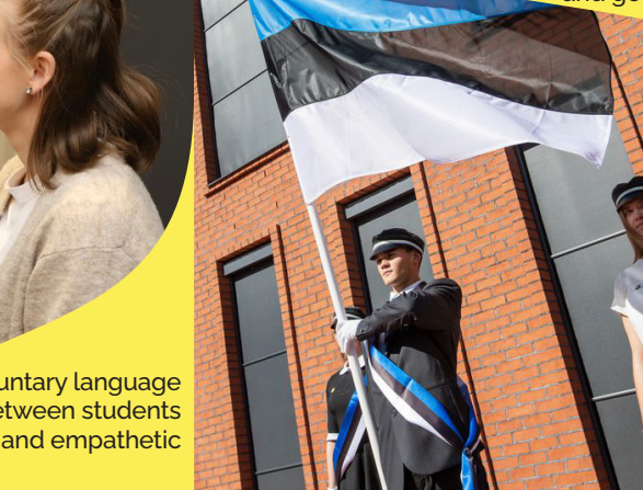
Voluntary language mentoring between students is educational, instructive and empathetic

Cooperation in solving tasks during the meeting day